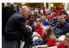
File At a ceremony last May, Gov. Mitch Daniels greets children attending a bill-signing for the school voucher legislation. A school choice group is